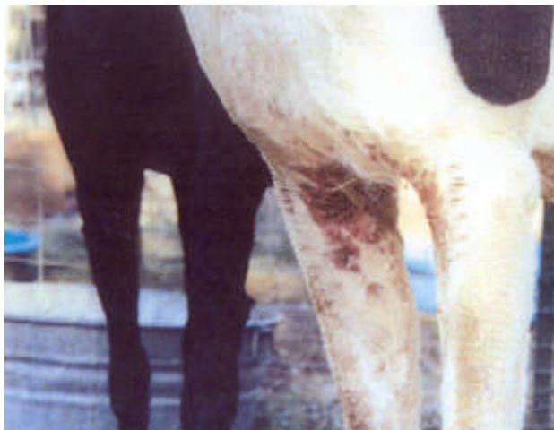
Alpaca Before, with bald, irritated spots.