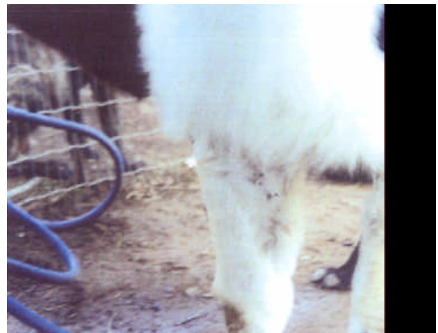
Alpaca After, with hair re-growth and healing skin.